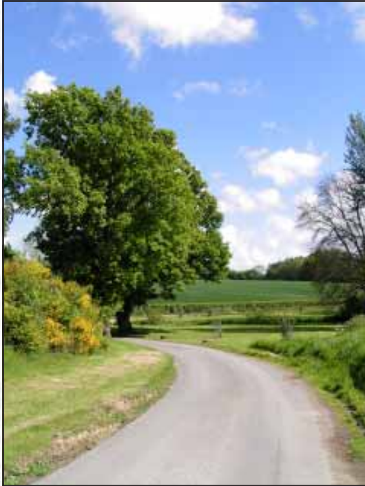
A view along Pump Lane