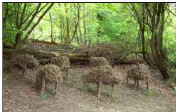
Wild Boar Sculptures

Follow Pump Lane for a distance of approximately 1\frac{1}{4} km ( \frac{3}{4} mile). After passing the main entrance to Newplace Farm, the road turns right, whilst a footpath continues straight ahead. Follow this signposted path into the field, and initially along the field edge, with woodland to your left. Continue across the field, heading slightly to the right of the cottage in the distance. Continue alongside the woodland shaw, and then cross the remainder of the field in the same direction to reach the main Lewes to Heathfield road. Turn left and follow the wide verge for a short distance before turning right into Bushbury Lane, taking care crossing this fast section of road.