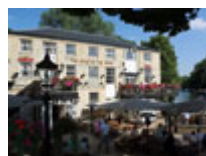
Head of the River, Folly Bridge, Oxford

A very popular traditional inn, bar and restaurant set in a stunning location overlooking the River Thames. Tel. 01865 351648