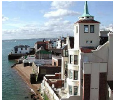
Portsmouth Harbour