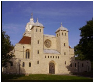
Portsmouth Cathedral