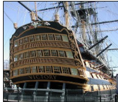
HMS Victory