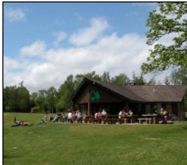
Visitor Centre, Alice Holt