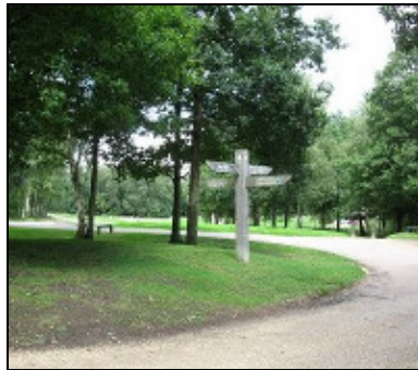
Direction Sign at Alice Holt © Don Cload