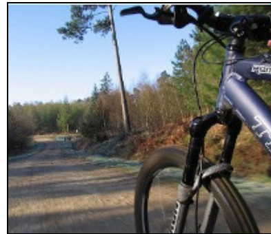
Alice Holt Cycle Path