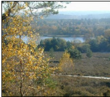
Frensham Little Pond