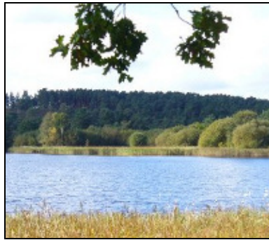
Frensham Little Pond