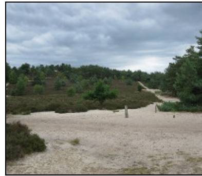
Heathland, Frensham