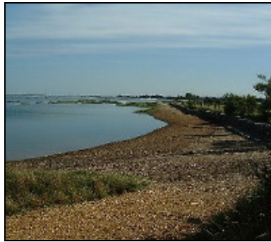
Towards Conigar Point