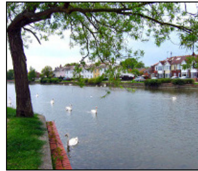
Millpond, Emsworth