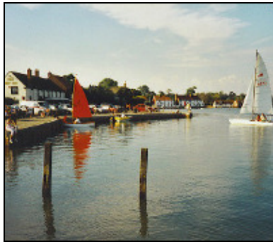
The Ship Inn, Langstone Harbour