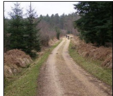
Anderwood Inclosure