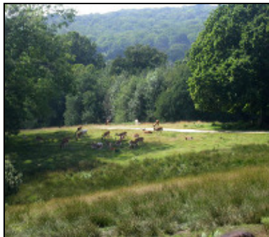
Deer Sanctuary