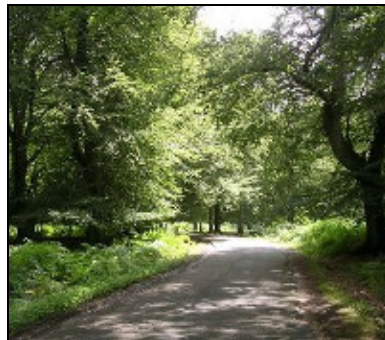
Bolderwood Arboretum