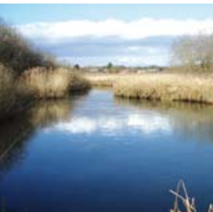
River Piddle fisheries