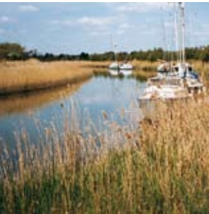
River Frome reed bed