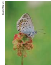
Silver-studded blue butterfly