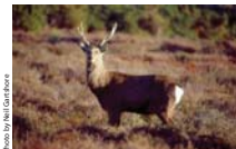
Sika deer are an Asiatic deer that were first introduced to Britain from the mid nineteenth century. Many escaped and formed wild populations like the herd in Wareham Forest today.