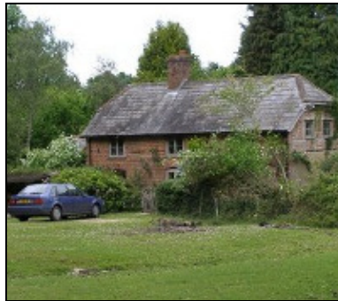
Cove Cottage, Dazel Corner