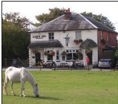
The Lamb Inn, Nomansland