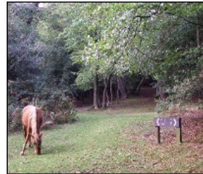
Bramble Wood, New Forest